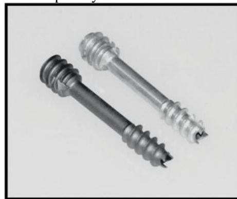
Figure 1: MAGNEZIX compression screw. Courtesy of Syntellix AG, Hannover, Germany.

In vivo studies have shown, Magnesium alloy MgYREZr (magnesium-yttrium-rare earth-zirconium alloy) to have good biocompatibility, osteo-conductive properties and no allergic reactions. (26-28) Thus it has been used as a substitute for titanium screws in both orthopedic and maxillofacial surgeries. A study conducted on 26 patients, to fix mild hallux valgus using MAGNEZIX compression screws (Syntellix AG, Hannover, Germany) (figure 1) has shown improved osseo-integration with better bone density. Furthermore, no negative effects such as complications, pain or allergic reactions were observed. The production of gas inherent to magnesium degradation generated neither bone erosion nor necrosis. The independent authors concluded that there was an equivalent clinical outcome between both types of screw, and recommended a larger and longer follow-up study. 29