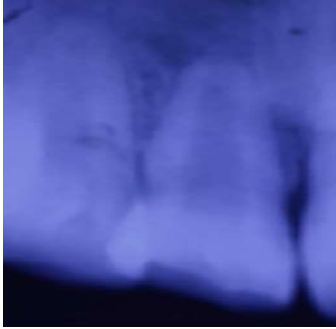
Figure: - 6 (Preoperative Radiograph)

probing. Radiographic examination demonstrated the presence of open apex and periapical radiolucency. The tooth did not respond to the pulp vitality tests. The final diagnosis is pulp necrosis with chronic apical periodontitis. The available treatment options were discussed with the patient and root canal therapy using MTA as an apical barrier was selected.