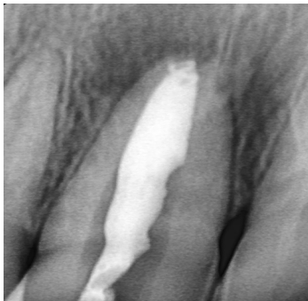
Figure: 8 (calcium hydroxide placed)

At the second appointment, calcium hydroxide was flushed with 5% sodium hypochlorite and rinsed with saline. Final irrigation was done with 2% chlorhexidine and the canal was dried with paper points. MTA (DENTSPLY, Tulsa Dental, and Johnson City, USA) was mixed according to the manufacturer's instructions and carried to the canal with an amalgam carrier. Apical plug of 6 mm of thick paste of MTA was placed and confirmed radiographically (Fig 3). A sterile cotton pellet moistened with sterile water was placed over the canal orifice and the access cavity was sealed with Cavite (3M ESPE, Seefeld, Germany)