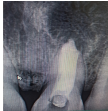
Figure:5 (Post Operative Radiograph)

After 72 hours, the hard set of MTA was confirmed and the remainder of the root canal was obturated with cold lateral compaction and zinc oxide eugenol sealer (Fig 4). Followed with post endo restoration with composite.