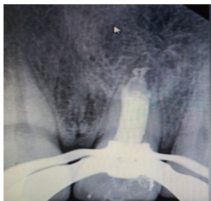
Figure: 3 (Calcium Hydroxide Placed)

The tooth was isolated under rubber dam and access cavity prepared. Working length was established by radiograph. The canal was gently debrided with large H-files (DENTSPLY Maillefer, Ballaigues, Switzerland) by doing circumferential filling and copious amounts of 5% sodium hypochlorite. Calcium hydroxide intra canal medicament was placed for one week to disinfect the root canal (fig: - 3)