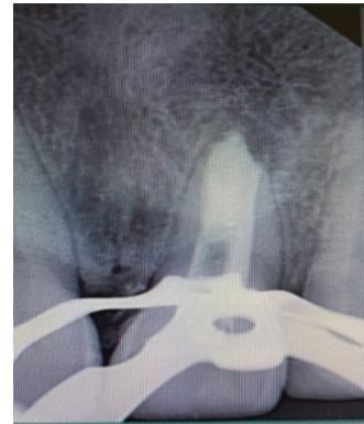
Figure: 4 (MTA Apical Plug)

At the second appointment, calcium hydroxide was flushed with 5% sodium hypochlorite and rinsed with saline. Final irrigation was done with 2% chlorhexidine and the canal was dried with paper points. MTA (DENTSPLY, Tulsa Dental, and Johnson City, USA) was mixed according to the manufacturer's instructions and carried to the canal with an amalgam carrier. Apical plug of 6 mm of thick paste of MTA was placed and confirmed radiographically (Fig 3). A sterile cotton pellet moistened with sterile water was placed over the canal orifice and the access cavity was sealed with Cavit (3M ESPE, Seefeld, Germany).