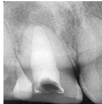
Figure: 9 (Post operative radiograph)

At the second appointment, calcium hydroxide was flushed with 5% sodium hypochlorite and rinsed with saline. Final irrigation was done with 2% chlorhexidine and the canal was dried with paper points. MTA (DENTSPLY, Tulsa Dental, and Johnson City, USA) was mixed according to the manufacturer's instructions and carried to the canal with an amalgam carrier. Apical plug of 6 mm of thick paste of MTA was placed and confirmed radiographically (Fig 3). A sterile cotton pellet moistened with sterile water was placed over the canal orifice and the access cavity was sealed with Cavite (3M ESPE, Seefeld, Germany)