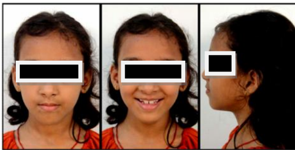
Figure:1. Pretreatment facial photographs

Intraoral examination (Fig 2) revealed the presence of mixed dentition of teeth with the presence of all permanent first molars and 11, 21, 31, 32, 41, 42 in upper and lower arches, 12 and 22 were in erupting stage. Mandibular deciduous second molars showed a mesial step relation to the maxillary deciduous second molars, and 11, 12, 21, 22 were in crossbite relation to 31, 32, 41, 42, 73, and 83. Mild crowding in lower arch and bilateral posterior cross bite was present. A reverse overjet of 1 mm and overbite of 3 mm was present.