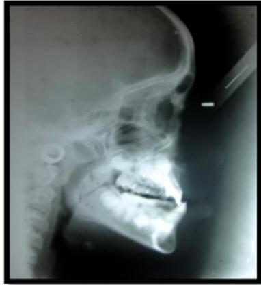
Figure: 4 Pretreatment Lateral Cephalogram

Diagnosis: The patient was diagnosed as developing skeletal class III malocclusion due to maxillary deficiency, slight vertical growth pattern with a mesial step relation of the maxillary deciduous second molars along with reverse overjet, retroclined upper and lower incisors, and mild crowding in relation to lower anterior.