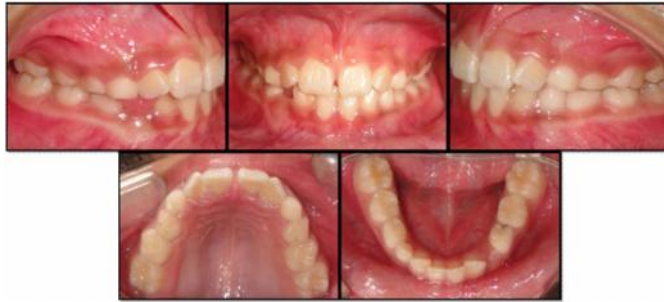
Figure: 7 Post treatment Intraoral Photographs

revealed establishment of the positive overjet and well settled occlusion (Fig 7).