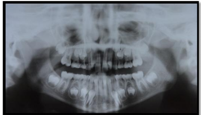
Figure: 3. Pretreatment OPG

The panoramic findings (Fig 3) revealed the presence of early mixed dentition with erupted permanent first molars, upper and lower central and lateral incisors; canines, and first and second premolars in an erupting stage.