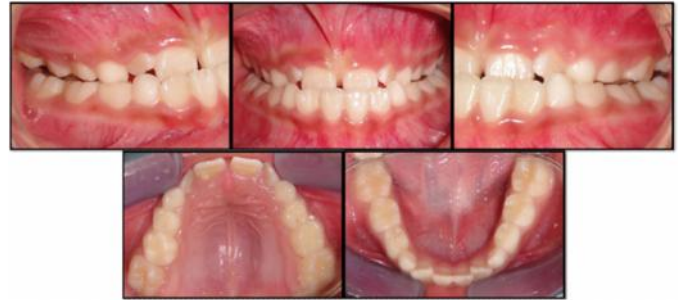
Figure: 2 Pretreatment intraoral photographs

The panoramic findings (Fig 3) revealed the presence of early mixed dentition with erupted permanent first molars, upper and lower central and lateral incisors; canines, and first and second premolars in an erupting stage.