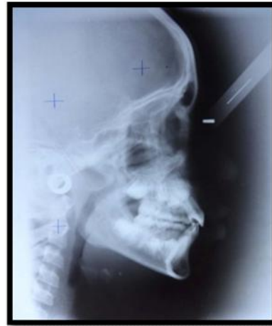
Figure: 8 Post Treatment Lateral Cephalogram

mandibular incisors, positive overjet of teeth and improvement of facial profile.