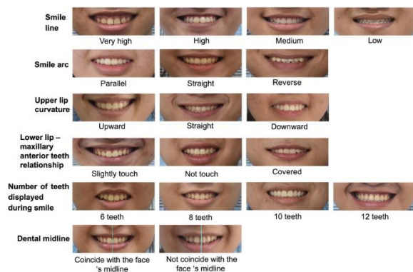
Figure 3: Aesthetic parameters of smile

Smile height, which refers to the amount of gingival display during smiling, is another key determinant of attractiveness. A medium smile line, showing approximately 0–2 mm of gingiva in the maxillary region, is generally considered most esthetic. Excessive gingival display (high smile line) or minimal tooth and gingival display (low smile line) may be perceived as less attractive depending on the individual case.