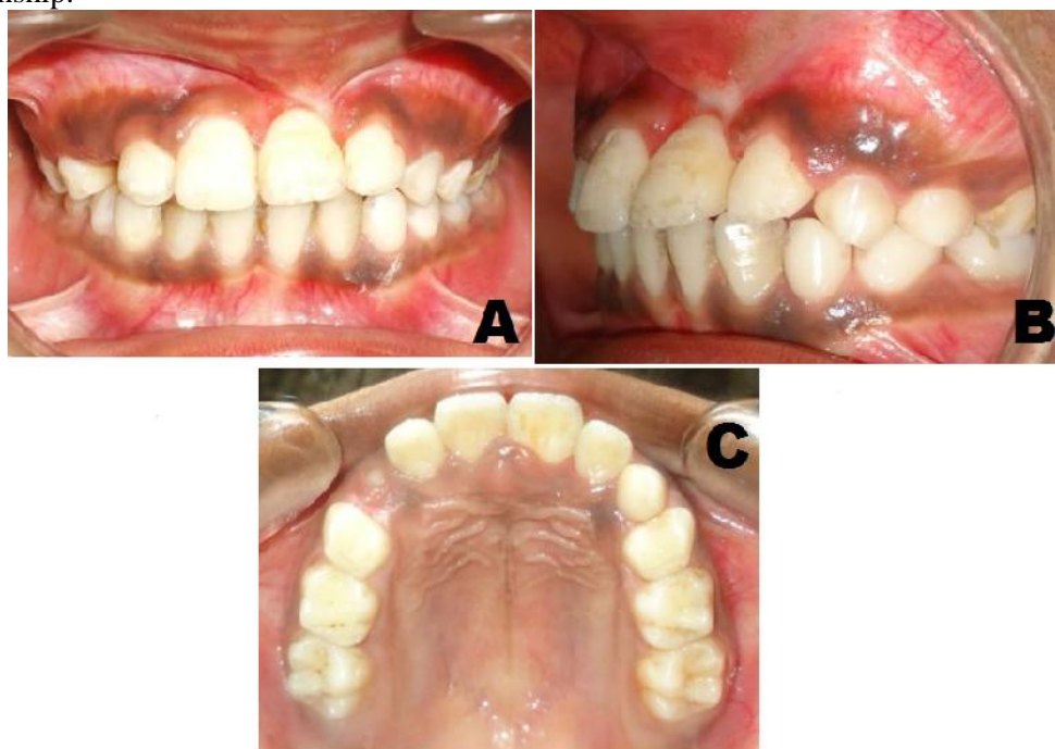
Figure 3: (A) Post-treatment intra-oral frontal photograph, (B) Post-treatment intra-oral left lateral photograph, (C) Post-treatment upper occlusal photograph.

TREATMENT PROGRESS: Prophylactic antibiotic started for five days and surgically soft tissue band in upper lip mucosa is removed. Purulent fluid is drained and pseudo pouch is removed to prevent further pus accumulation. Antibiotic and chlorhexidine mouth wash started after operative procedure, Sutures removed after 7 days.