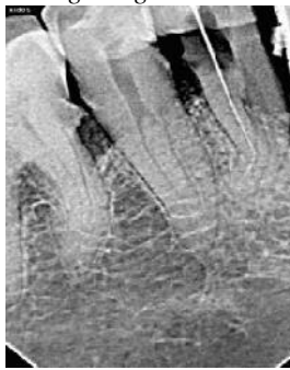
Figure 4: Negotiating Length of curvature.