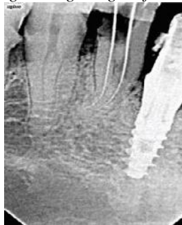
Figure 5: Proper working length determined for both roots after negotiation.

Cleaning and shaping of the canals was performed using Twisted Files (Sybron Endo) under copious irrigation with 5.25% sodium hypochlorite solution followed by 17% EDTA solution. The canals were dried with paper points, and the tooth was temporized. Later, the canals were obturated with cold, lateral compaction of gutta percha cones (Dentsply). A post obturation radiograph was taken to evaluate the quality of obturation (Figure 6).