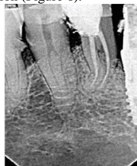
Figure 6: Post operative radiograph.

Cleaning and shaping of the canals was performed using Twisted Files (Sybron Endo) under copious irrigation with 5.25% sodium hypochlorite solution followed by 17% EDTA solution. The canals were dried with paper points, and the tooth was temporized. Later, the canals were obturated with cold, lateral compaction of gutta percha cones (Dentsply). A post obturation radiograph was taken to evaluate the quality of obturation (Figure 6).