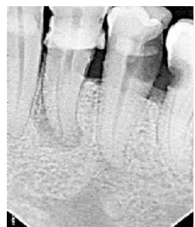
Figure 2: Preoperative radiograph 3 rd Quadrant showing normal anatomy.

The canal patency could not be obtained with a 10 # K file (Dentsply, Maillefer) hence a 6 # K flex file (Sybron Endo) was used by precurving in a distolingual direction. Mesial Canal within the mesial root was easily accessed till the apex with a 6 # K flex file whereas there was difficulty in accessing the apical third of the distal canal due to “s” shaped curvature (Figure 3).